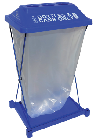
"CLEARSTREAM" for hallways, cafeteria in middle and high schools 26.5" wide 42" tall 20.5" deep