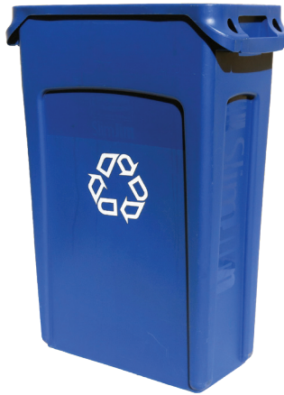
"SLIM JIM" for copy rooms, library 22.5" wide 30" tall 11" deep