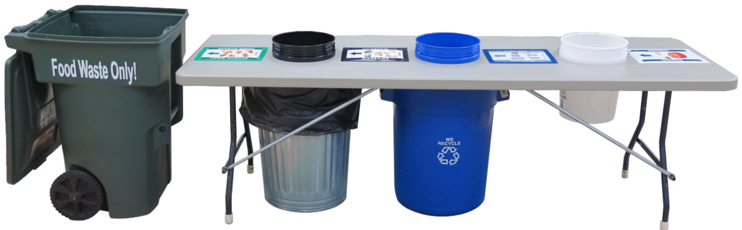
SORT TABLE for elementary & middle school cafeterias 30" wide 96" long 30.5" tall

Accessories include: signs, white 5-gal bucket & filter, blue ring, black ring, 32-gal blue Brute, 2 "Nifty Nabbers." Note: garbage can not provided