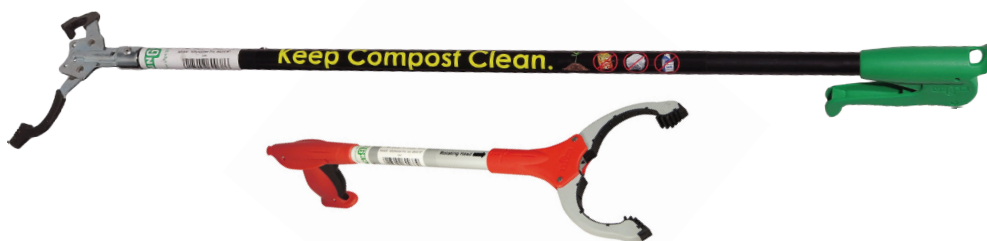
"NIFTY NABBERS" for removal of contaminants from food waste cart in cafeteria 18" or 36" long