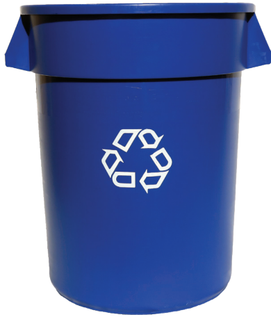
32 GALLON BRUTE CAN for central collection areas 22" diameter 27.25" tall