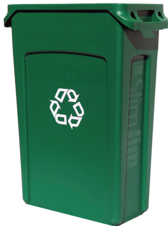
"SLIM JIM" for kitchen 22.5" wide 30" tall 11" deep

Accessories include: signs, white 5-gal bucket & filter, blue ring, black ring, 32-gal blue Brute, 2 "Nifty Nabbers." Note: garbage can not provided