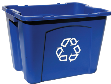
CLASSROOM RECYCLE BIN for classrooms or high-volume offices 21" wide 15" tall 16" deep