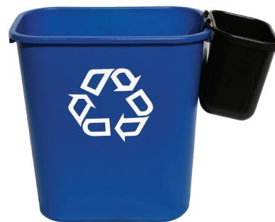
DESKSIDE RECYCLING CAN & GARBAGE SIDECAR for offices 10.5" wide 15.25" tall 15" deep