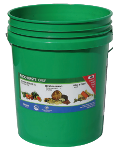
5-GALLON BUCKET for kitchen prep 12" diameter 15" tall